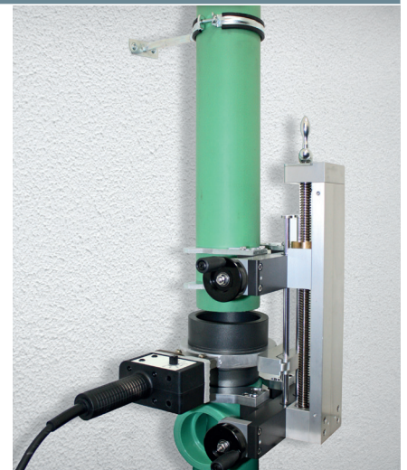
Vertical socket welding