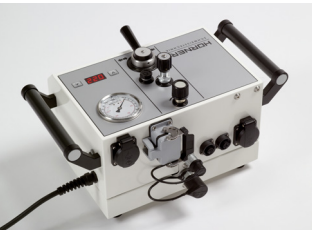
All connections at the back panel of the hydraulic unit