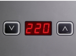
Centralized temperature control

All components are covered by the HÜRNER warranty.