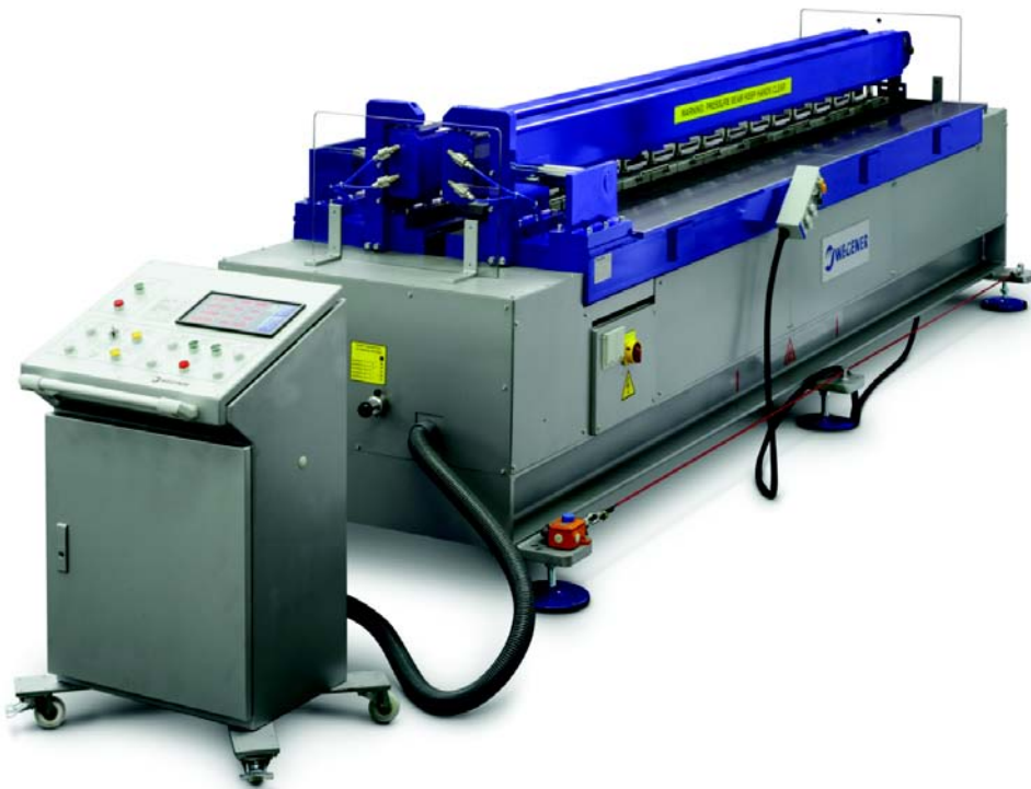
Sheet Butt Welder

Most machines are microprocessor equipped to facilitate setting of the machine and assure full repeatability. Provided the parameters are set correctly, heated tool butt welding is considered the strongest weld.