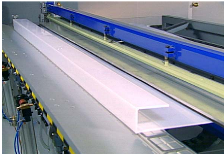
Sheet Bending Machine

Industrial thermoplastic sheet benders work much like a metal sheet brake. In addition to the breaking function, the material needs to be heated up across the bending line to avoid breakage. Similar to butt welding, the heat and time settings are material-specific. For sheet gauges greater than 1/4", a bottom in addition to a top heating bar needs to be used to adequately heat the bending zone. The bending of PP and PE requires a V-shaped bar to penetrate about 2/3 into the sheet and to remove the excess material out of the corner. PVC is bent with a flat bar.