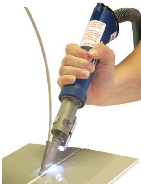
High speed welding

The most common form of hot gas (air) welding is called high speed welding. The high speed welding tip is designed to guide the welding rod into the weld zone while simultaneously heating up the rod and the base material. The shoe at the end of the rod orifice allows the operator to apply the welding pressure. The welding pressure is dependent on material type and rod size. The key to quality hot gas (air) welding is the correlation of constant temperature, speed, pressure and air volume.