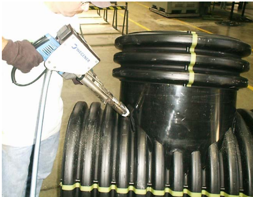
Hot air extrusion welder

The technology of manufacturing plastic sheet, pipe, rod and tubing is used on a miniature scale in the hot gas (air) extrusion welding process. An extrusion screw inside a melting chamber processes 5/32" or 3/16" diameter welding rod coming off a spool and supplies a fully molten, plasticized strand of material in a larger diameter. The design and size of the weld is determined by a Teflon (PTFE) shoe, which is mounted to the end of the melting chamber. PTFE is the material of choice as it has a very low coefficient of friction and is easily machined. To preheat the parent material, a hot air system is mounted on the side of the machine with the outlet right in front of the Teflon shoe. Depending on application, these systems may be self-contained with an internal air supply, or may require connection to an external air supply.