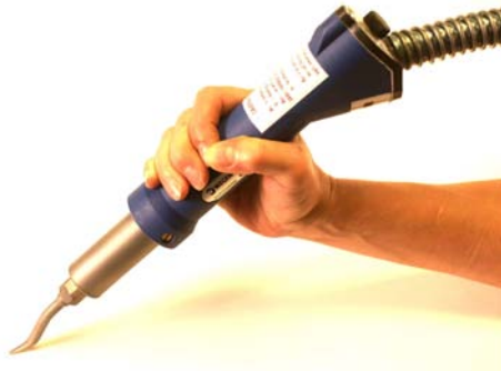
Welding gun with tacking tip

area should be scraped to remove the oxidation layer created by the hot air during the tacking process.