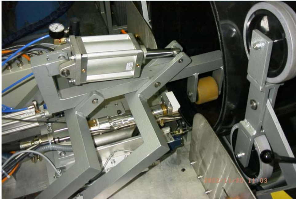
Automated extrusion welder

Since automated systems are rare, the majority of extrusion welding is performed manually. Manufacturers are continually working to develop machines providing the best weight, size and output ratio to facilitate the task of the operators. The challenge is to build smaller, more compact machines while not sacrificing durability and quality of the extrusion process with the various materials.