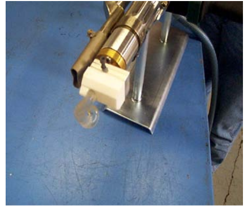
Air outlet, teflon shoe for T-joint welding and emerging PP extrudate

Of great importance is the welding shoe located at the very front where the extrudate emerges. The shoe serves as a die determining the size and the geometry of the weld. It is made of PTFE, which is easily machined and, due to its low coefficient of friction, provides for a smooth weld appearance. The speed of an extrusion weld is directly related to the size of the weld compared to machine output capacity. Similar to hot gas (air) hand welding, the extrusion weld requires a prepared V-groove to create a full penetration weld. Depending on sheet thickness, the angle of the V should be between 45° and 90°. A V-groove is not used when welding thin gauge materials in the range of .020" to .100" where an overlap weld is preferred.