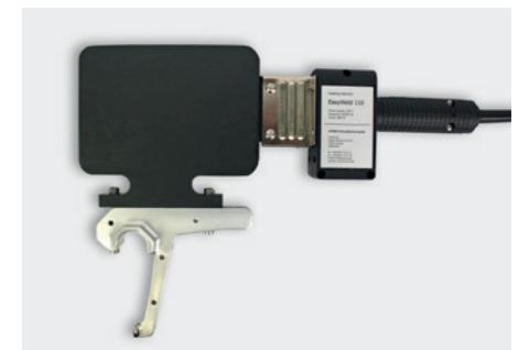
Electr. controlled heating element

The facing tool with electrical drive, too, features horizontal adjustability and a two-edge usable blade, all of which extend its useful life.