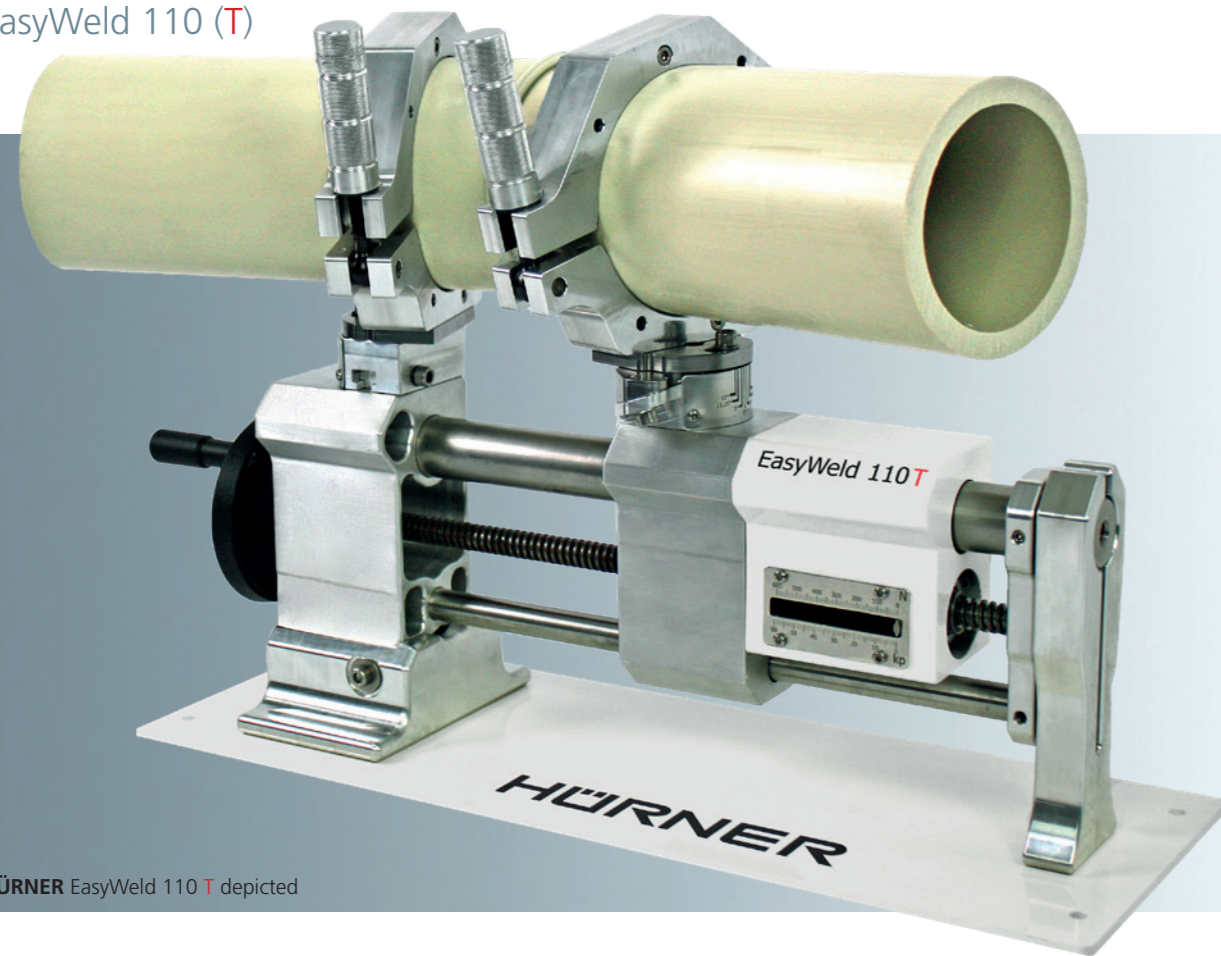
HÜRNER EasyWeld 110 T depicted