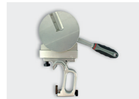
Manual facing tool

Part of the system's standard delivery is the perfectly ergonomically designed manual facing tool with the possibility of horizontal adjustment and a two-edge usable facing blade.