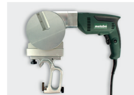
Power facing tool

Part of the system's standard delivery is the perfectly ergonomically designed manual facing tool with the possibility of horizontal adjustment and a two-edge usable facing blade.